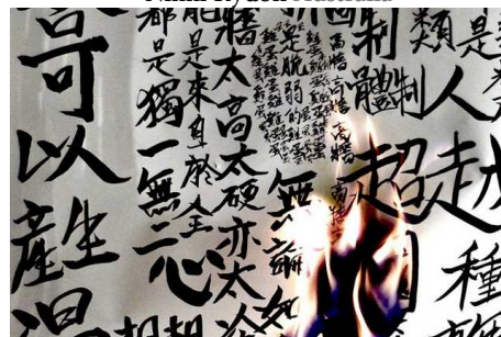
To the Light in Chinese by Sim Fong Zoe Lai