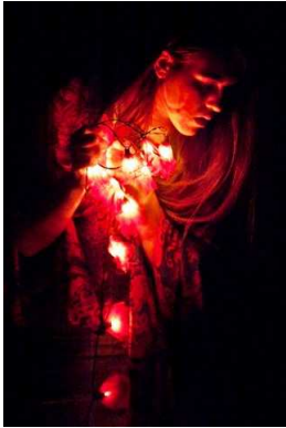
Nua Watford Cendra Spain